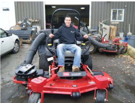
Siena College Z-Master 580-D with Triple Bagger