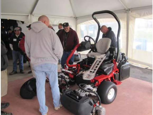
Above: Golf course personnel check over the new Toro TriFlex during Toro's Greensmaster Tour Event at Capital Hills Golf Course in Albany on May 5th.