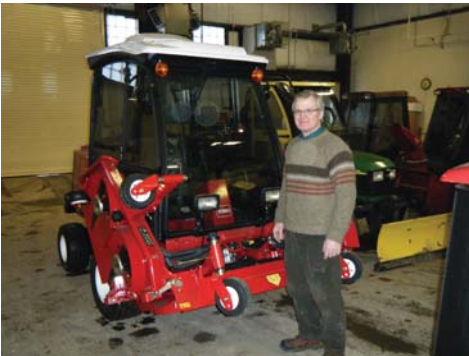
SUNY Albany with their new Toro Groundsmaster 4110-D with cab and lights