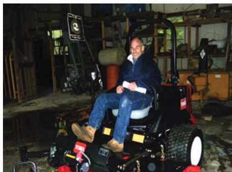
A crew member at John Boyd Thatcher State Park sits on their new Toro Groundsmaster 7210