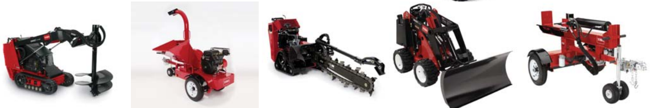
Compact Utility Loaders, Stump Grinders, Chippers, Trenchers, Log Splitters and More