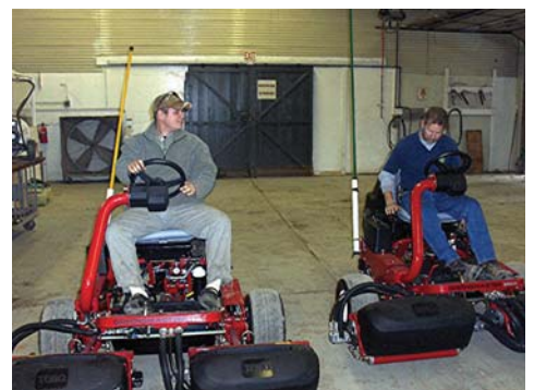
Two new Greensmaster 3150-Q's ready to go at Carvel Counry Club