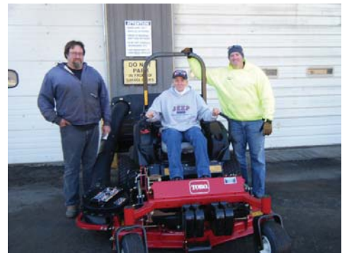
Saratoga DPW takes delivery of their new Groundsmaster 7210 with Dump from Seat Collection System