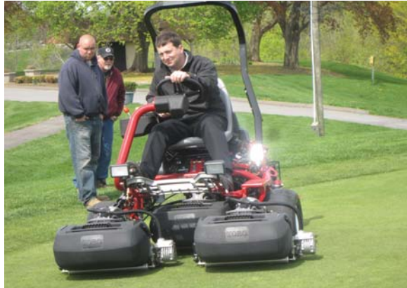
Below: Toro Engineers reviewed product features and demonstrated the new TriFlex for the nearly 60 customers in attendance. Customers also had a chance to try the equipment. See all the pictures on Grassland's Facebook Page