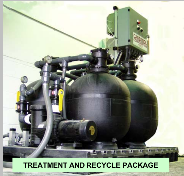
TREATMENT AND RECYCLE PACKAGE

Screened wash water is pumped from transfer sump to the clarifier where additional solids are removed by quiescent settling. The clarified water then flows to a storage tank, prior to final treatment and reuse.