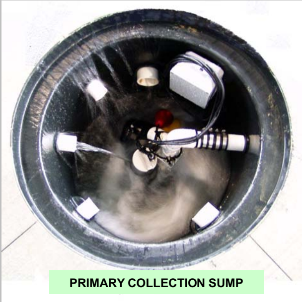
PRIMARY COLLECTION SUMP

Dirty wash water collects in the primary sump. At water high level, the pump engages. During pumping, the water is vigorously agitated to ensure that grass, and dirt, do not accumulate in the sump.