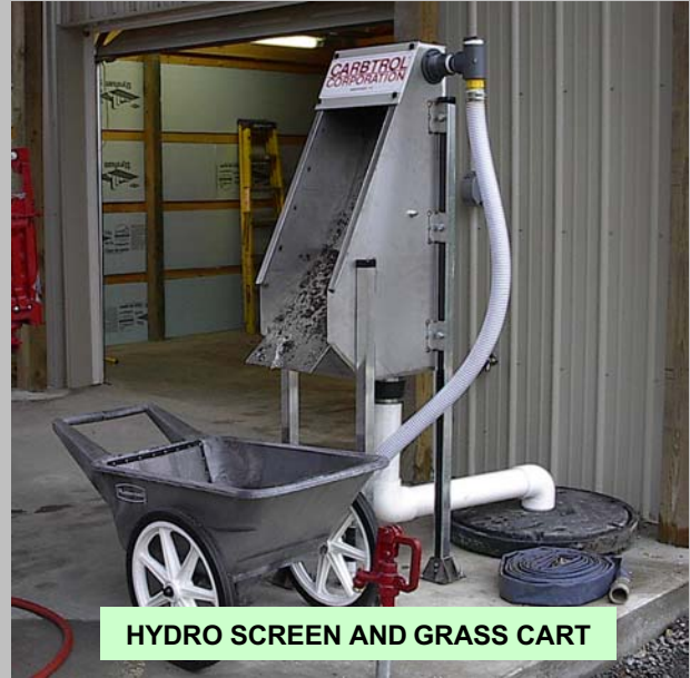
HYDRO SCREEN AND GRASS CART

Dirty wash water collects in the primary sump. At water high level, the pump engages. During pumping, the water is vigorously agitated to ensure that grass, and dirt, do not accumulate in the sump.