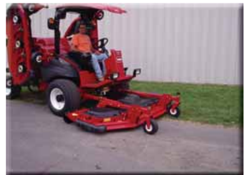
New Toro Groundsmaster 5900 mower for Liverpool Central School District