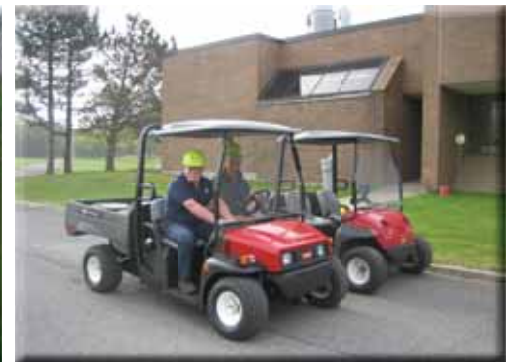
The crew from The Town of Colonie Pure Waters admires their new Toro MDE Mid Duty Electric Workman along side their older Toro e2065 Mid Duty Workman. The electric (battery powered) is now preferred over gas units.