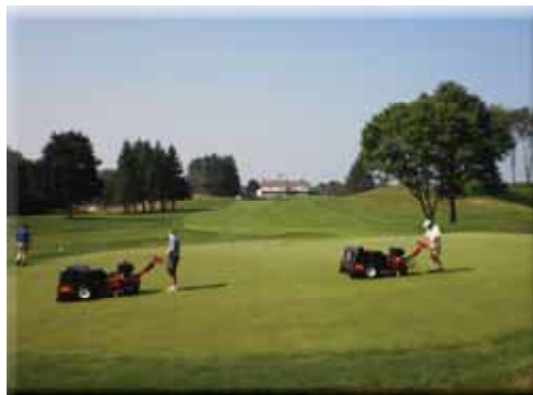
The Yahnundasis Golf Club using both Toro 648 aerators to speed up productivity while aerating