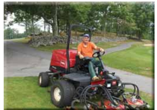
Tarry Brae Golf Course staff take delivery of a new Toro Groundsmaster 4300-D at