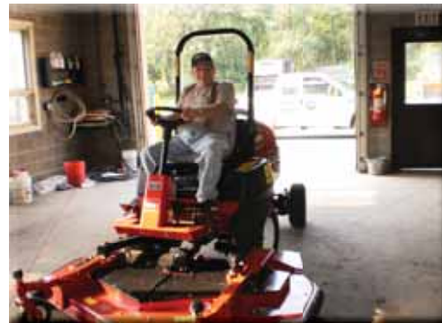
Green Lakes State Park Golf Course shows off their new Toro Groundsmaster 3280