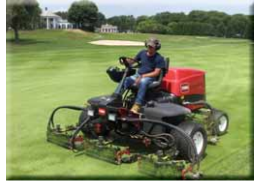
New Reelmaster 5410 Fairway mower at The Schuyler Meadows Club in Loudonville, New York