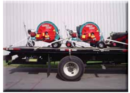
Two new Micro Rain traveling sprinklers ready for delivery to Gouverneur Central Schools