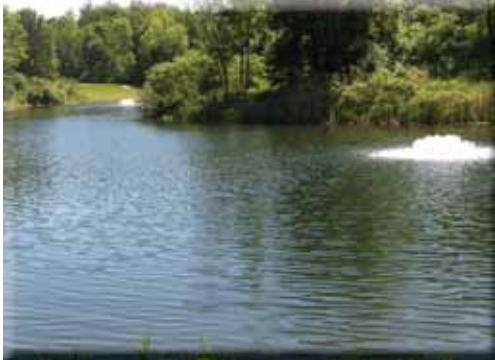
New High Flow Otterbine Aerators at The Schuyler Meadows Club in Loudonville, New York