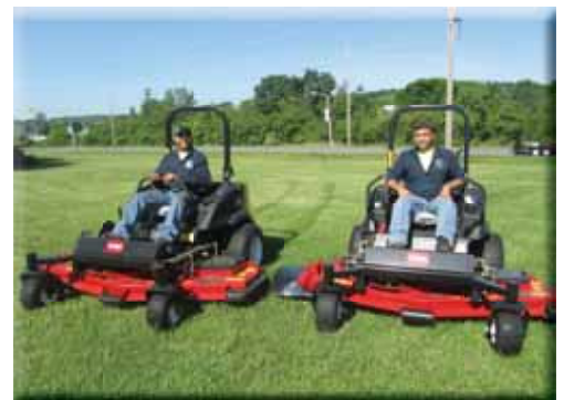
City of Albany Department of General Services -With their new Toro Groundsmaster 7210's

Check for Special Pricing and Closeouts on Our Web Site.