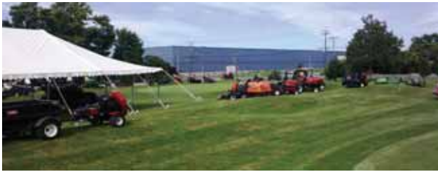
Pre-Owned Equipment on display during Grassland's August sale at Liverpool Country Club