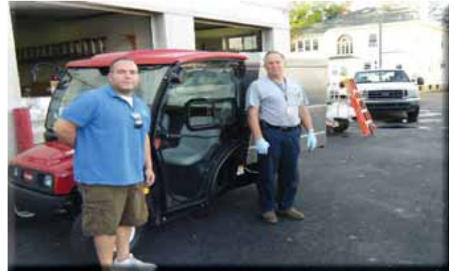
Maintenance workers at The College of Saint Rose in Albany admire their new MDE Electric Toro Workman, Full Cab & Edmunds Utility Box