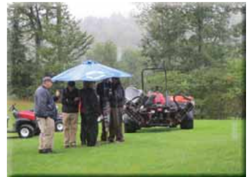
Vendors and superintendents huddle under an umbrella during a downpour at the VTGCSA meeting and field day at Okemo in September. The storm passed and those in attendance were able to try out some of the Toro equipment.