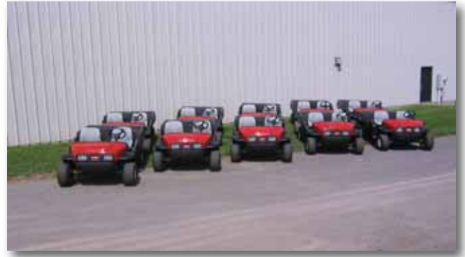
Fleet of 10 new Toro Workman just prior to delivery to the Turning Stone Casino Resort in Verona, New York