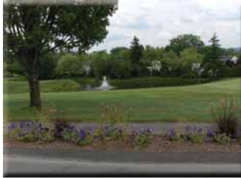
New Otterbine at Wolferts Roost Country Club