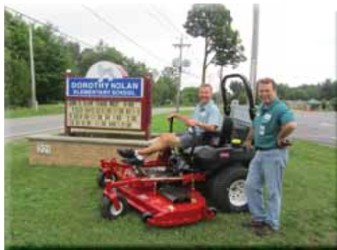
Workers admire 500 Series Z-Master at Dorothy Nolan School in the Saratoga City School District