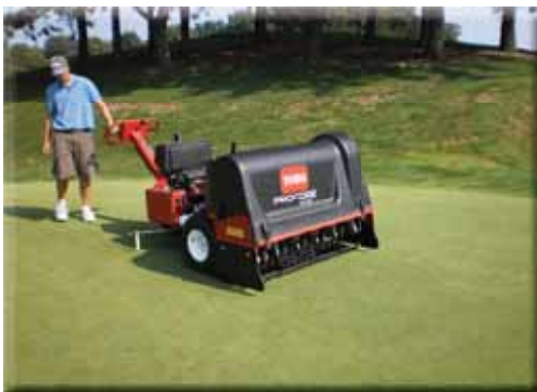
The Yahnundasis Golf Club using one of 2 Toro 648 aerators they recently purchased from Grassland